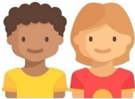
System of Care Accomplishments