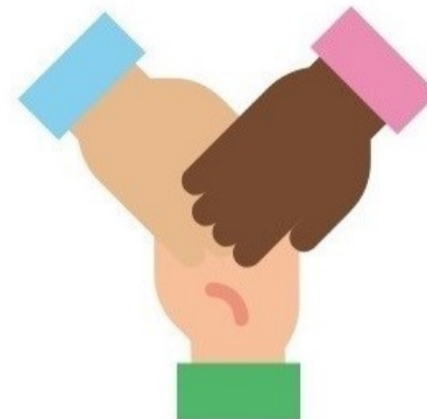
Network Service Providers