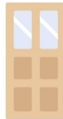
Improving Front Door Experience