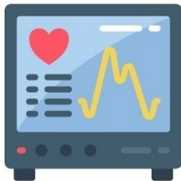
Biometric Quality Measures Project