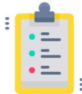
Hispanic/Latinx Outreach Project