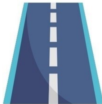
Race to the Top Project