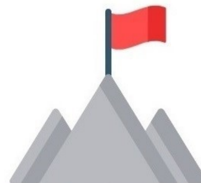
Mission, Vision & Values