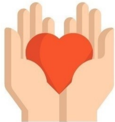
Trauma Informed Care